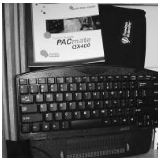
Freedom Scientific's Pacmate QX400 was purchased with a generous grant from the Parker Nelson Foundation.